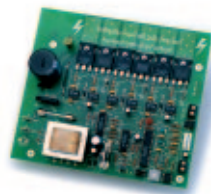
ServoMax™ Model 220

Digital Control Systems, Inc. manufactures an array of motor speed controllers, including the products pictured at right: