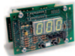
ServoMax™ Model 210

For more information, please contact us at: