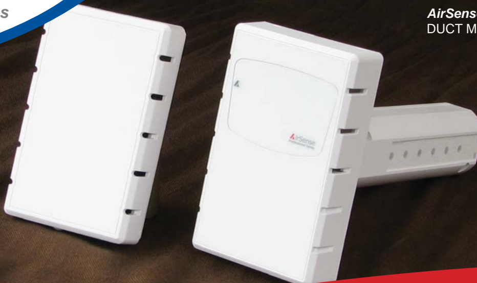
AirSense™ 308T WALL MOUNT